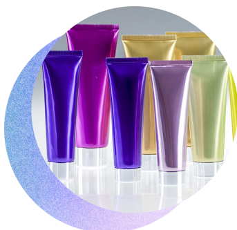
Color-matching to the desired tone

Realize the artwork on ABL tubes by adopting silk-screen printing, hot stamping, offset printing, or adding a gradient veil to layer the entire look. A fascinating design pops with vibrant rays of light.