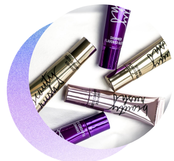
Silk Screen printing